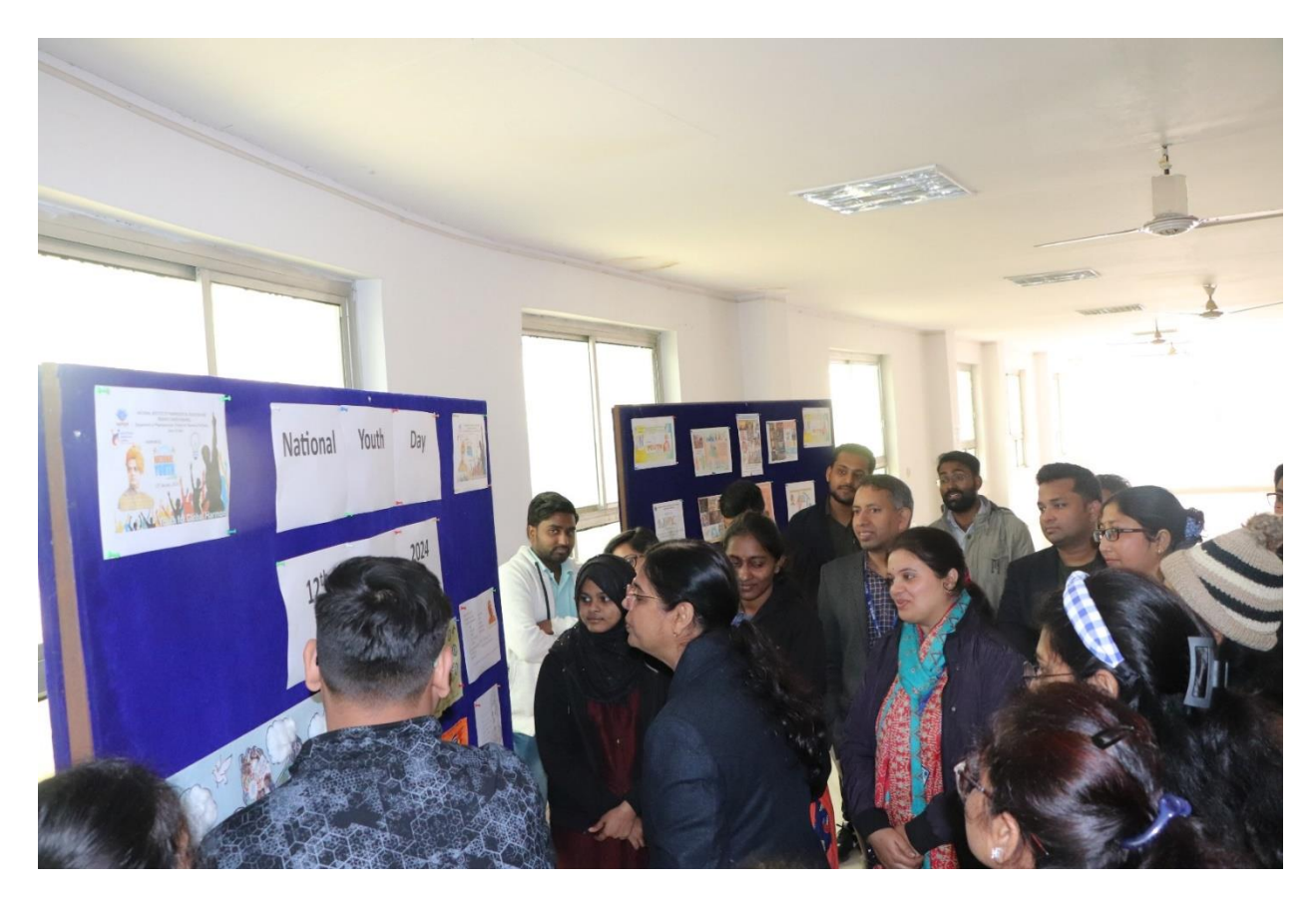
Students presented the poster on the theme "Youth for Global Harmony".